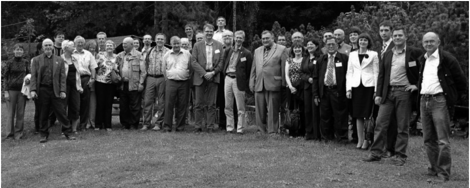
Delegates and guests at the meeting in Zvolen