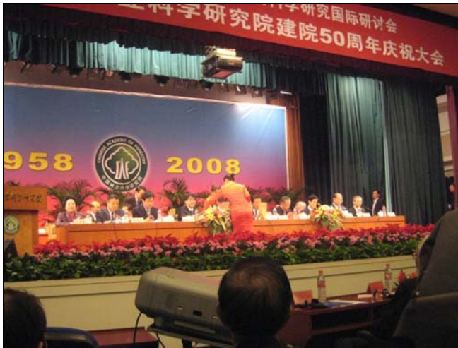
Chinese VIP at the Chair